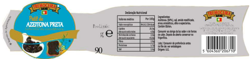
Patê de Azeitona Preta 90 g Black Olive Patê 90 g