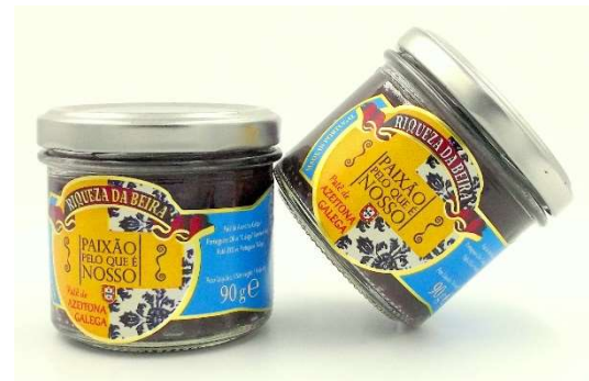
Patê de Azeitona Galega 90 g "Galega" Olive Patê 90 g