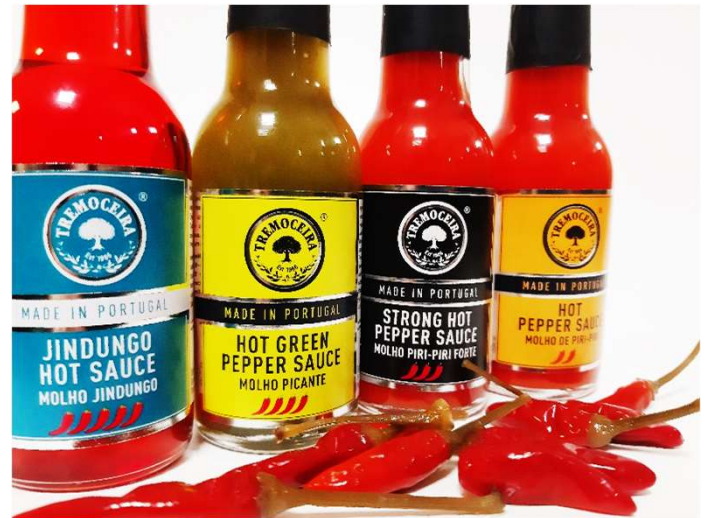
Frasco 100 ml / Jar 100 ml (12 uni. / Cass)