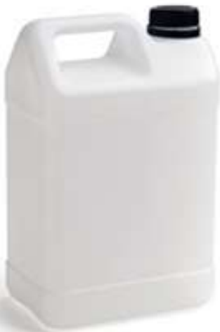
Jarrican 5 lt